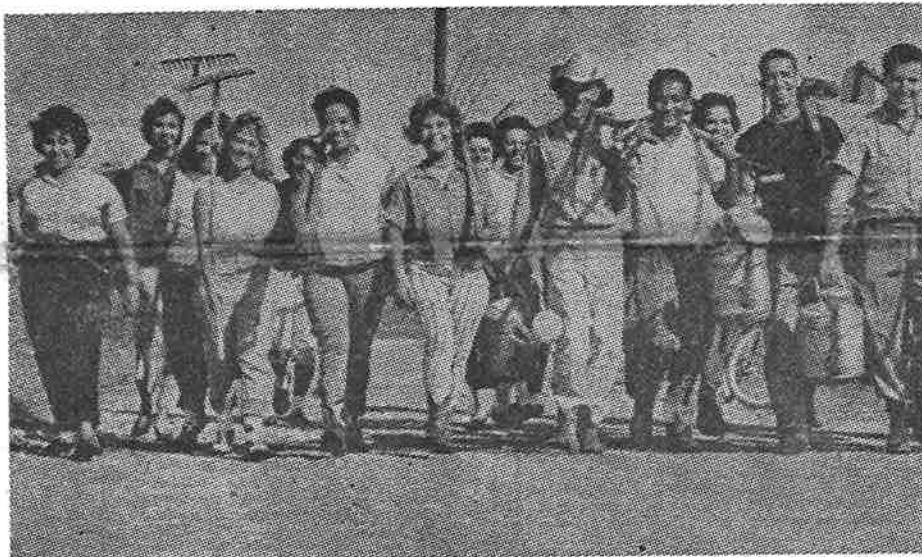
Young agricultural students volunteer for labor on Cuban farms.